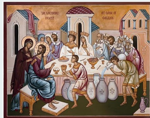
Wedding Feast at Cana

Stevens Point Deanery Marriage Preparation