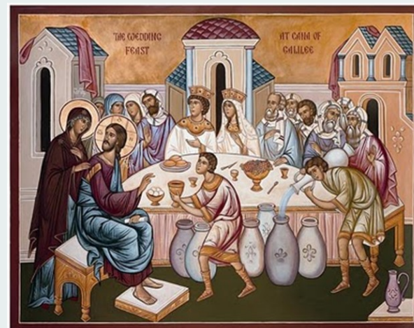
Wedding Feast at Cana

Stevens Point Deanery Marriage Preparation